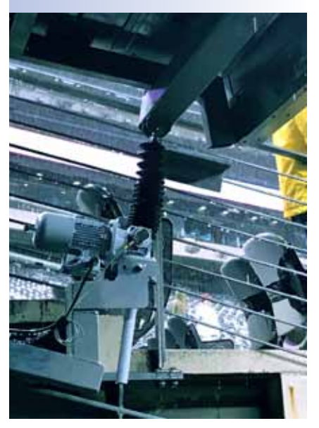
Duff-Norton AAS controls enclosure and electrical connectors are designed to meet NEMA Type 4 rating.